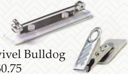
Pin or Swivel Bulldog $0.75