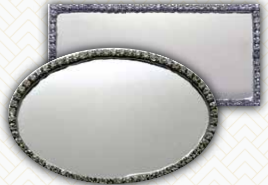
Rhinestone Frame $25.00