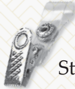
Strap Bulldog $1.00