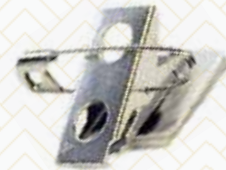
Pin/Clip Combo $1.50