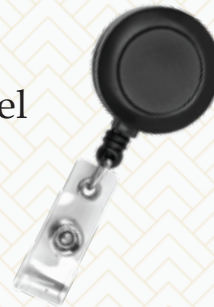
Badge Reel $3.35