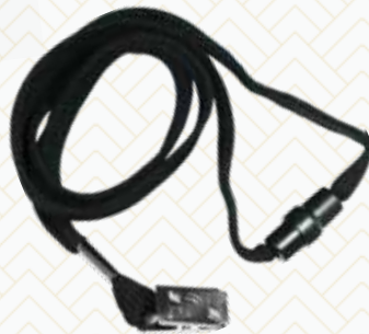
Bulldog Lanyard $1.50