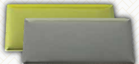
Beveled Frame $7.95