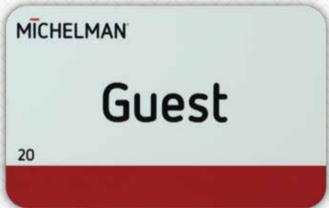
FC-200 -Non Personalized Digitally Printed Badge Mono White Material, .030" Thick

The price includes a full color design printed on a white card in the standard size. We can custom cut to size and attachments are available.