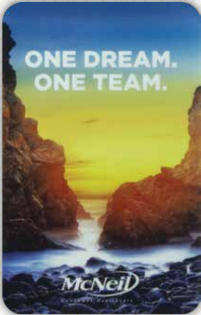
FC-200 -Non Personalized Digitally Printed Badge Mono White Material, .030" Thick

Non personalized badges are perfect for membership cards, emergency information, loyalty cards, mission statements, or ANY SITUATION YOU NEED EVERYONE TO HAVE THE SAME INFORMATION.