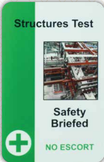
FC-200 -Non Personalized Digitally Printed Badge Mono White Material, .030" Thick