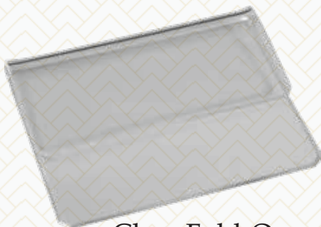
Clear Fold-Over $3.35