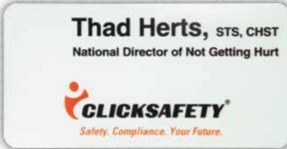
FC-100AL - Digitally Printed Badge White Aluminum