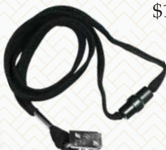
Bulldog Lanyard $1.50