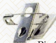
Pin/Clip Combo $1.50