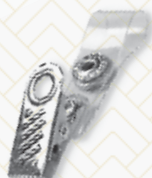
Strap Bulldog $1.00