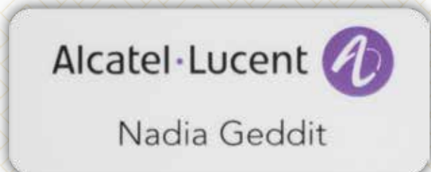
FC-100AL - Digitally Printed Badge White Aluminum