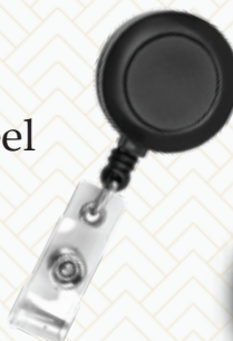
Badge Reel $3.35