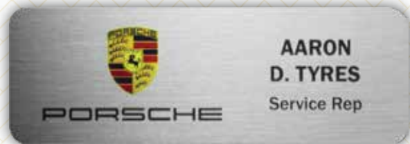
FC-100AL - Digitally Printed Badge Br. Silver Aluminum