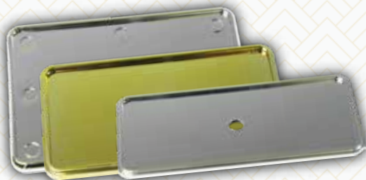
Rounded Frame $5.00