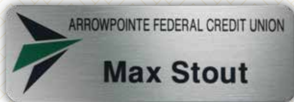
FC-100AL - Digitally Printed Badge Br. Silver Aluminum

The price includes a full color logo, up to two lines of personalization, and your choice of either a jeweler's pin or swivel bulldog attachment. Other attachments are available.