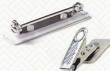
Pin or Swivel Bulldog Included