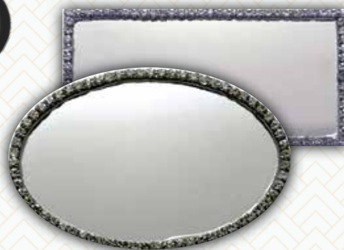
Rhinestone Frame $25.00