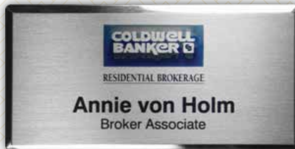
FC-100AL - Digitally Printed Badge Br. Silver Aluminum ◇ Beveled Frame