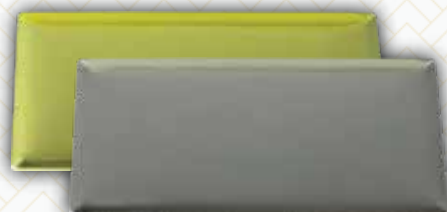
Beveled Frame $7.95