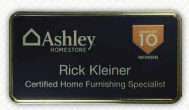
FC-100 - Digitally Printed Badge Brushed Gold/Black Material • Gold Frame