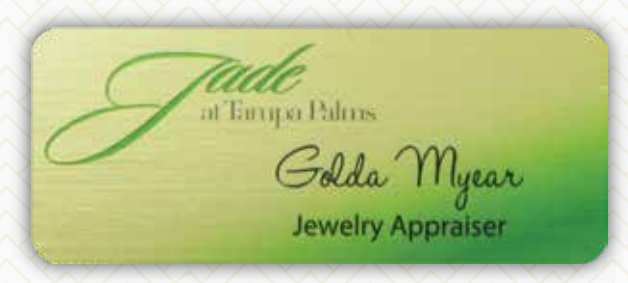
FC-100 - Digitally Printed Badge Brushed Gold/Black Material