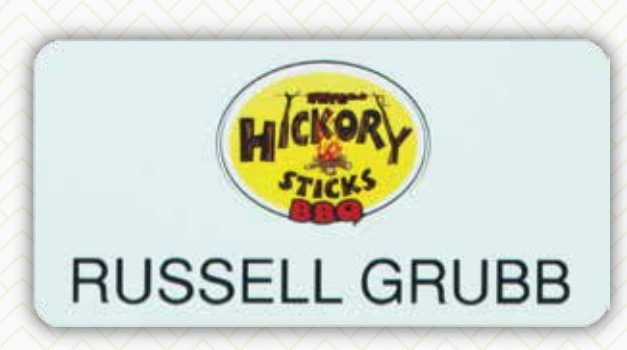
FC-100 - Digitally Printed Badge Mono White Material