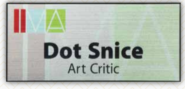
FC-100 - Digitally Printed Badge Brushed Silver/Black Material * Beveled Edges