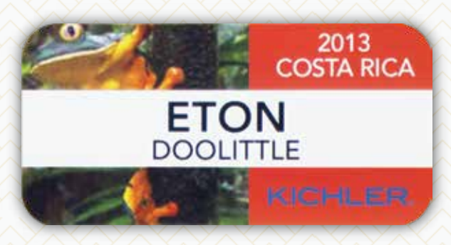
FC-100 - Digitally Printed Badge Mono White Material $ 1/4" Rounded Corners

The price includes a full color logo, up to two lines of personalization, and your choice of either a jeweler's pin or swivel bulldog attachment. Other attachments are available.