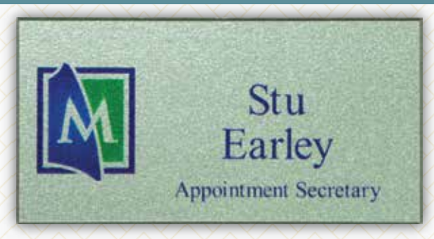
FC-100 - Digitally Printed Badge Smooth Silver Material * Beveled Edges